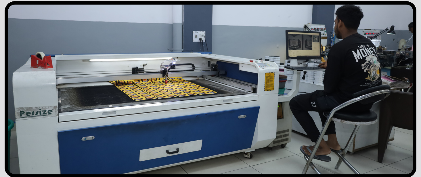
"Ultimate solution for narrow fabric excellence, from concept to creation."